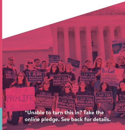
*Unable to turn this in? Take the online pledge. See back for details.